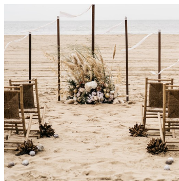
Rentals + Floraldesign